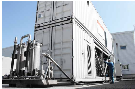
FILTRATEC's gas-tight decanters cannot create their own explosive zone as they are covered in nitrogen. The three phases (oil, water and solids) are produced in one single step