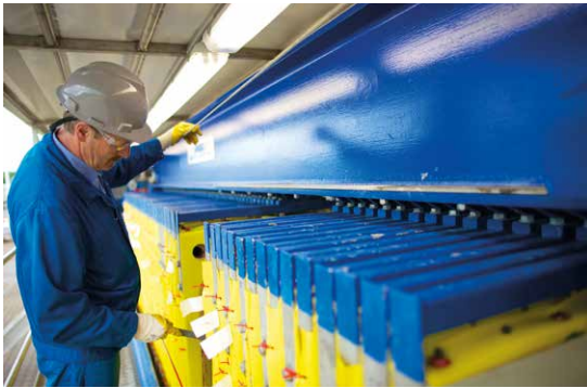
Our mobile sludge dewatering units are operated on-site by our own qualified personnel