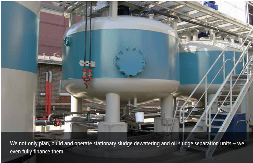
We not only plan, build and operate stationary sludge dewatering and oil sludge separation units – we even fully finance them

FILTRATEC specialises in both dewatering sludge and separating oil sludge for industrial companies. Equipped with a wide range of machinery, we are able to handle this complex work, no matter what the challenge. Our customers have been using our services for more than 40 years now and primarily come from the chemical and petrochemical industry, the iron and steel sector as well as the construction and waste management industry.